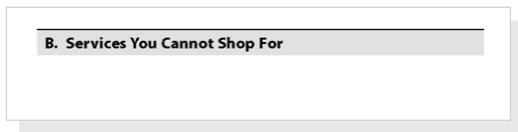
FIGURE 10: SERVICES YOU CANNOT SHOP FOR TABLE OF THE LOAN ESTIMATE

Services You Cannot Shop For are items provided by persons other than the creditor or mortgage broker that the consumer cannot shop for and will pay for at settlement. (§ 1026.37(f)(2)) Items listed as Services You Cannot Shop For must use terminology that describes each item, and disclose them in alphabetical order. (§ 1026.37(f)(5))