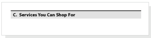
FIGURE 11: SERVICES YOU CAN SHOP FOR TABLE OF THE LOAN ESTIMATE

Services You Can Shop For are provided by persons other than the creditor or mortgage broker and are services that the consumer can shop for and will pay for at settlement. (§ 1026.37(f)(3)) Items listed as Services You Can Shop For must use terminology that describes each item and disclose them in alphabetical order. (§ 1026.37(f)(5))